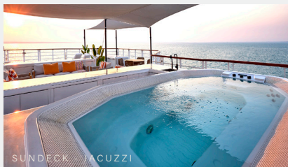
SUNDECK - JACUZZI