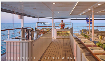
HORIZON GRILL, LOUNGE & BAR