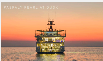
PASPALY PEARL AT DUSK