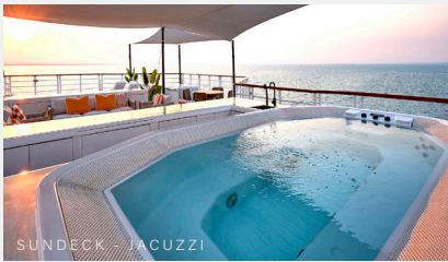
SUNDECK - JACUZZI