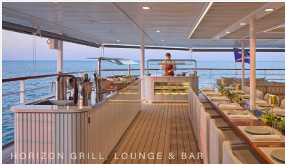
HORIZON GRILL, LOUNGE & BAR