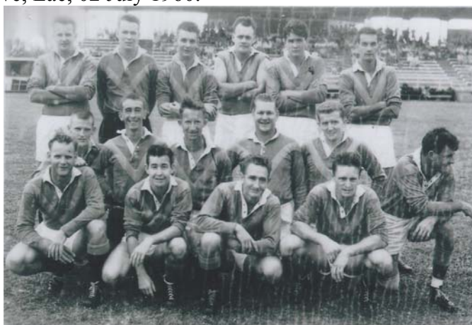
New Guinea National Football League 1961

Scores: New Guinea – 14 goals, 22 behinds, 106 points / Papua 10 goals, 7 behinds, 67 points Played at Niall Reserve, Lae, 02 July 1960.