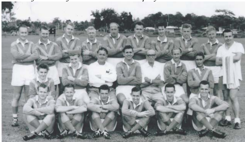
New Guinea National Football League 1960

Note: These photos and further information about the players are on our website: www.pngaa.net