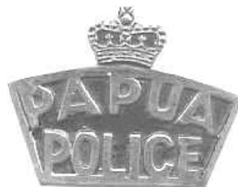
Papua Police badge c 1946-47