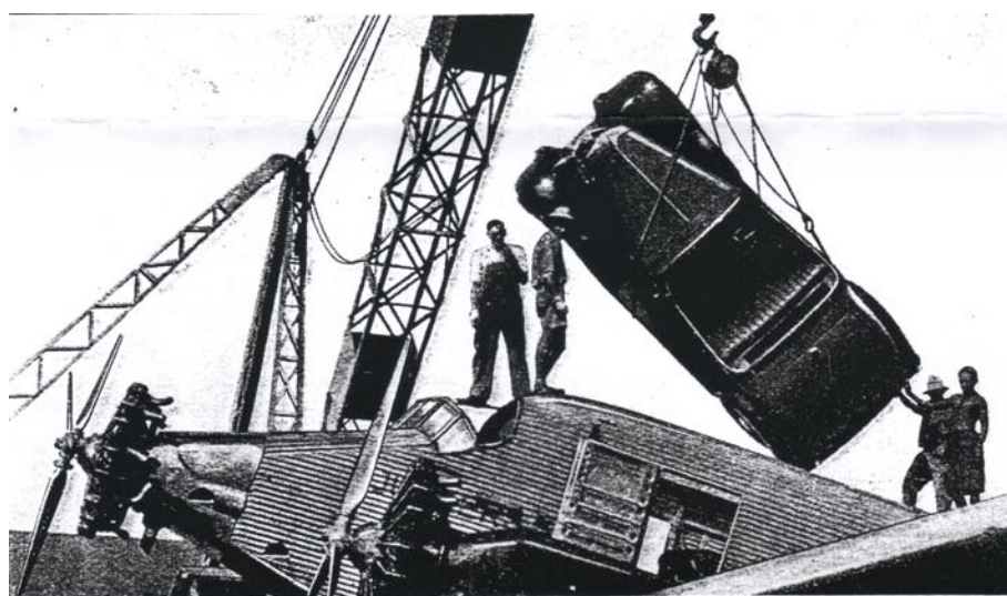
SHIPPING A DODGE AUTOMOBILE IN JUNKER PLANE (LAE TO BULOLO, NEW GUINEA)

The first Junker W/34 went to New Guinea in April 1928. The larger Junker G/31, which arrived in PNG in March 1931, had a specially designed loading hatch cut in the roof to help transport large items and dredge parts to the goldfields of Wau and Bulolo.