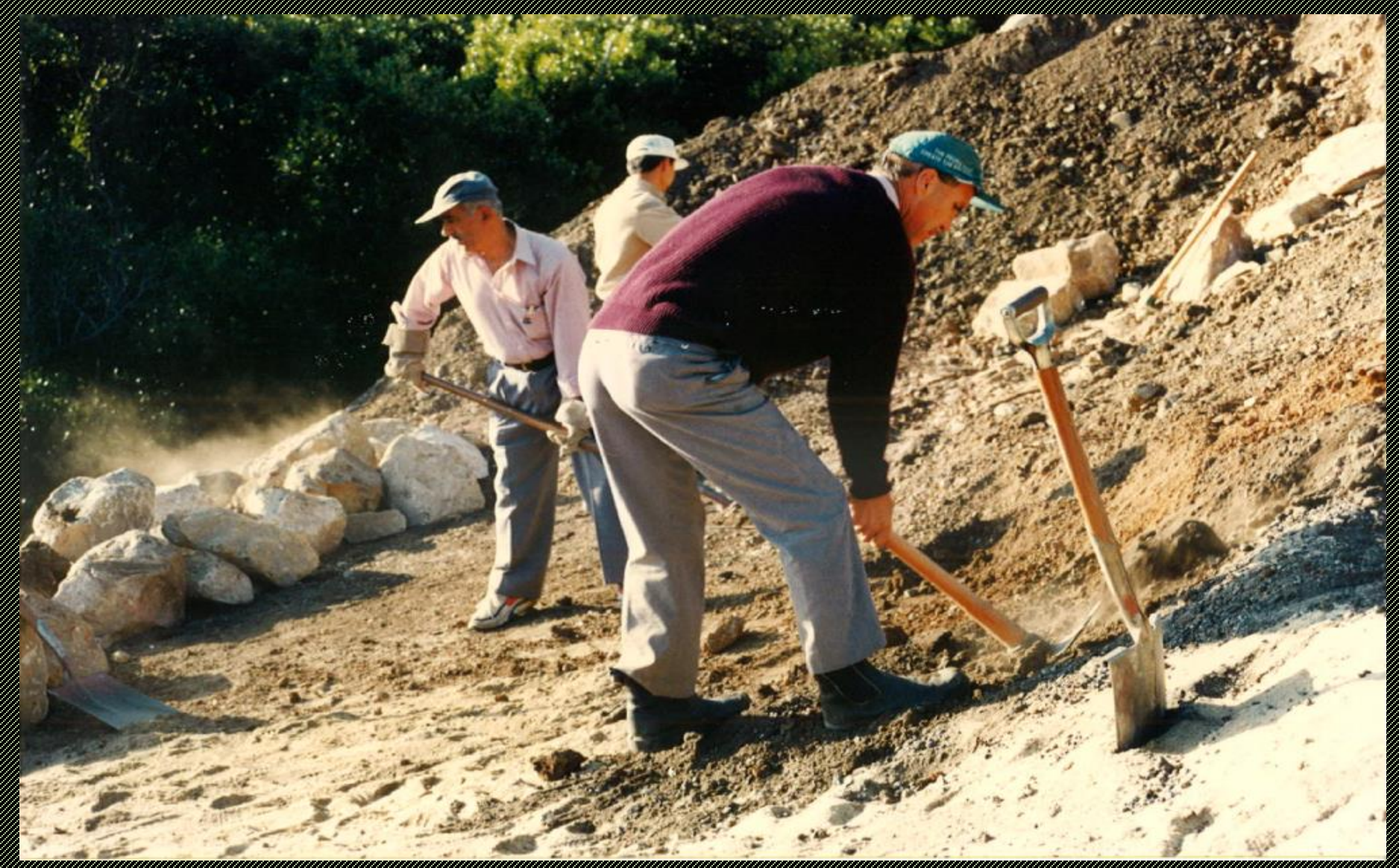
DEET program – providing skills to the unemployed under the funding