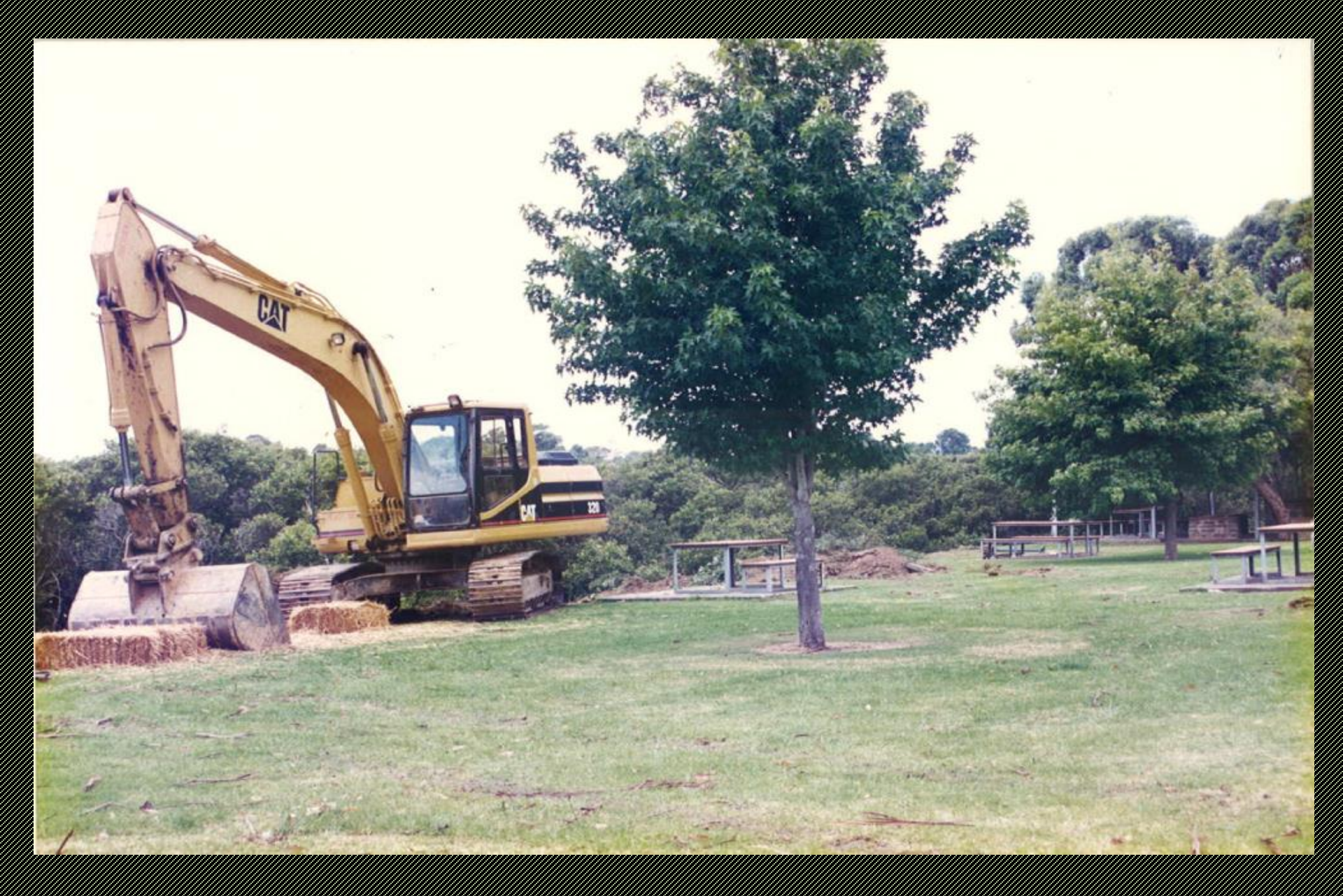
The site before the memorial was constructed