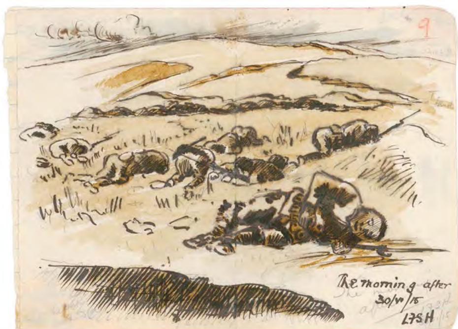
The Morning After

Photos from Mitchell Library, State Library of NSW