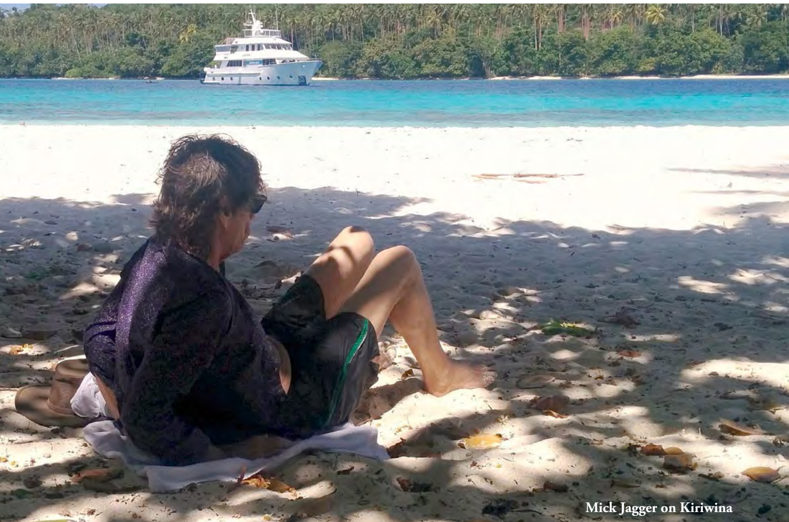
Mick Jagger on Kiriwina