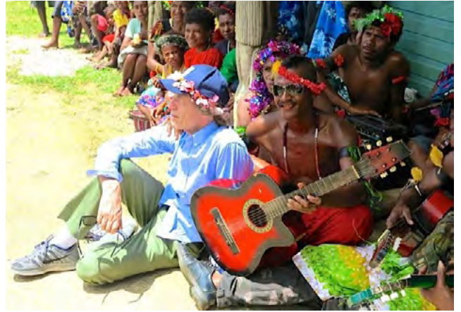
Mick Jagger with a group of kids at Kitava