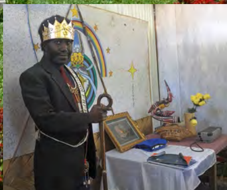
The King and I