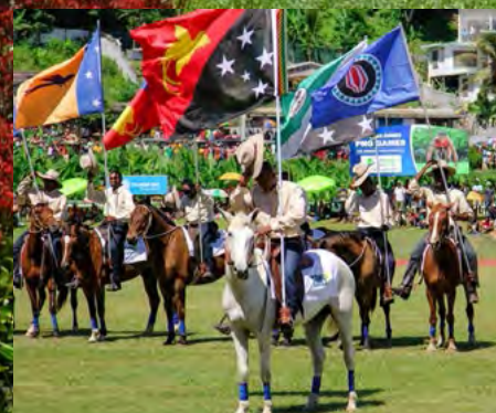
2014 PNG Games