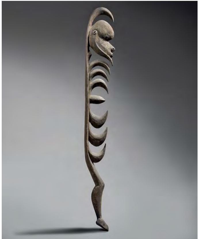
Yimam people, Korewori River, East Sepik Province Yipwon early-mid 20th century, wood, patina. National Gallery of Australia, Canberra, purchased 2011, IRN 211518