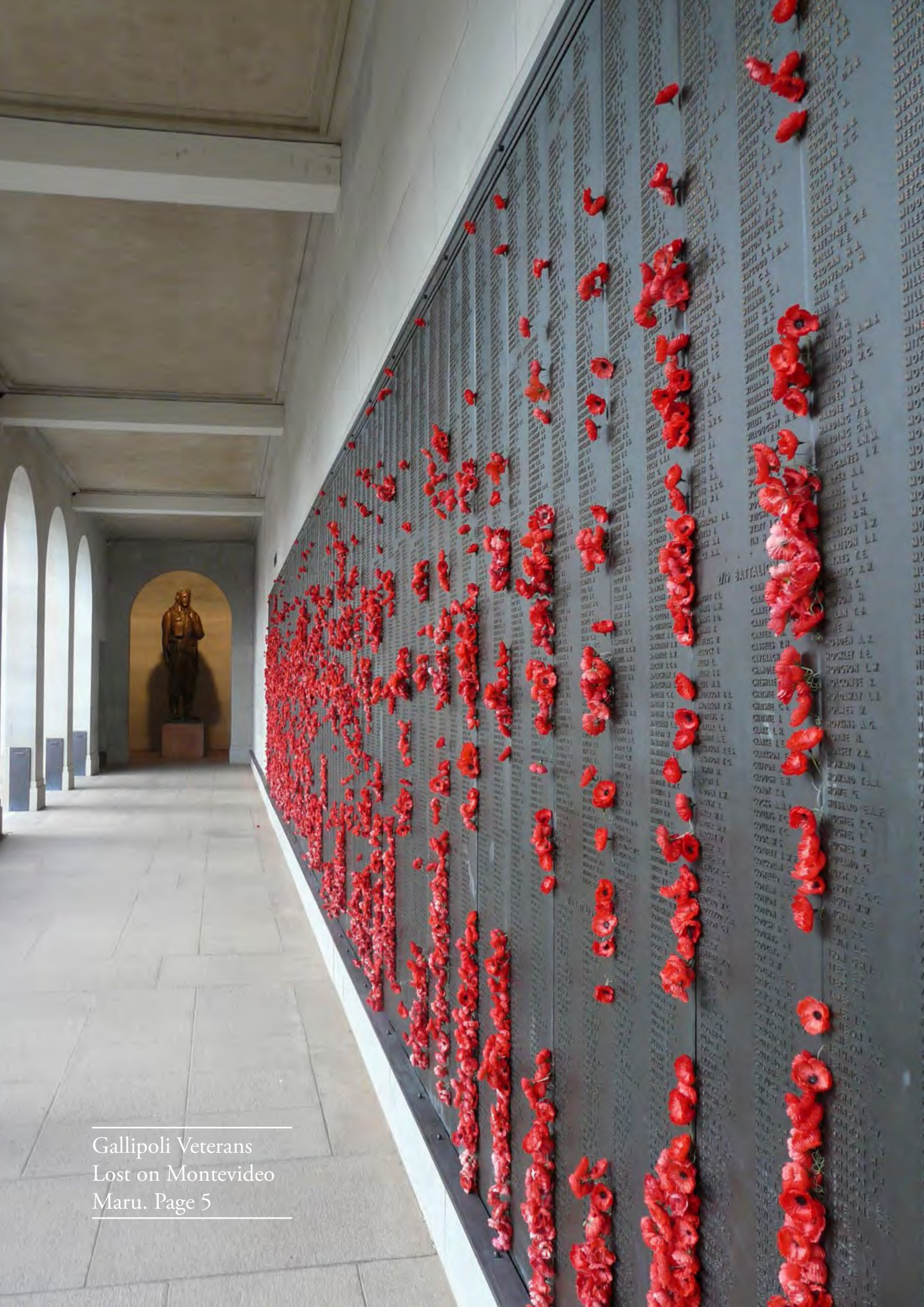
Gallipoli Veterans Lost on Montevideo Maru. Page 5