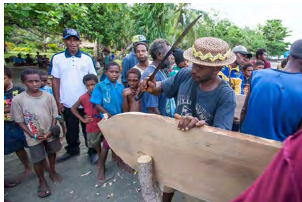
A Tupira Surf Club member uses a bush knife to shape his new surfboard.

http://www.abc.net.au/news/2015-04-15/papua-new-guinea-surfers-learn-how-to-craft-diy-boards/6393942