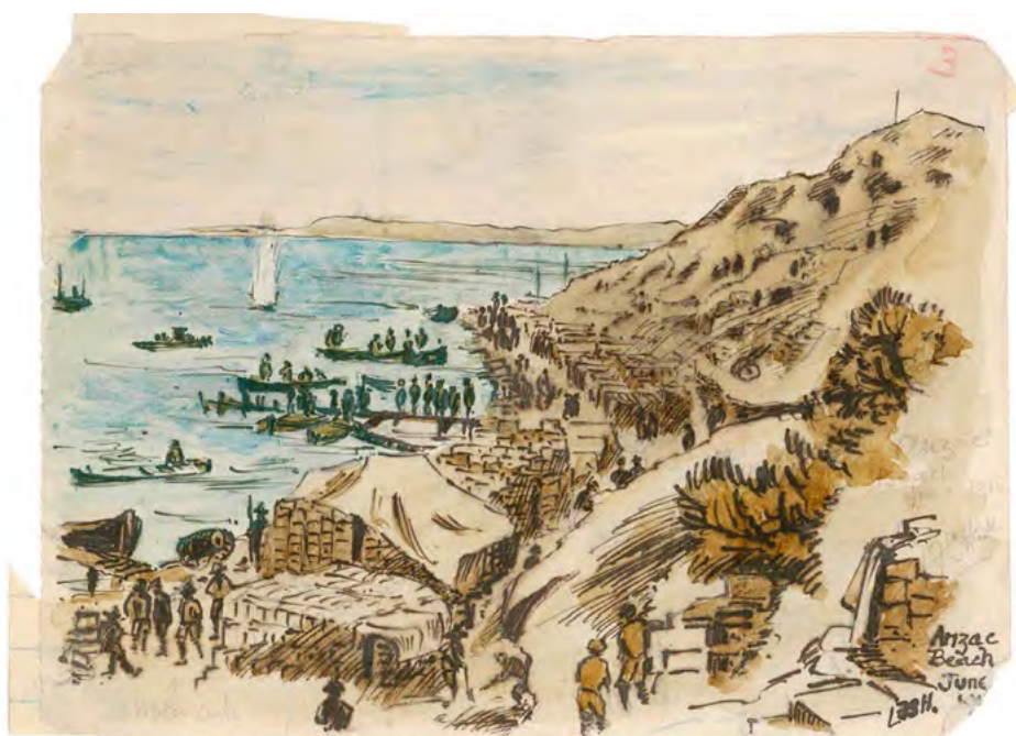
ANZAC Beach – June 1915