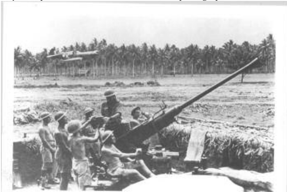
Kittyhawk landing at Gurney Airstrip